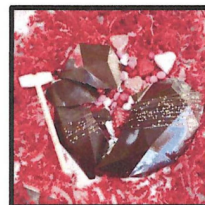
Heart Breaker- Chocolate - $40 Chocolate, Filled with Candy, Hammer Included