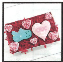
You Croc My World