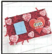
Never LEGO of My Heart