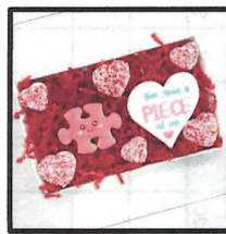
You Have a Piece of my Heart