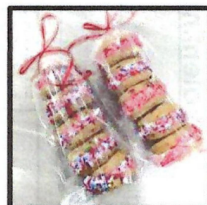
Cookie Sandwich Sleeve - $15 Mini Cookies with Buttercream in the Center- 1 Sleeve