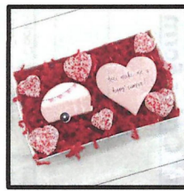
You Make Me a Happy Camper