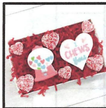
I Chews You