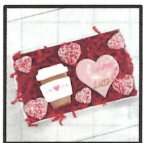
I Love You a Latte

Cookies are heat-sealed for freshness and come boxed, ready to gift!